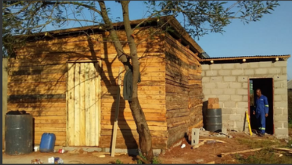
Mushroom Shed - Paul Quinn AMEC - Eswatini

Multiple projects throughout the District intended to increase food security, provide jobs, and increase intergenerational fellowship by working together.