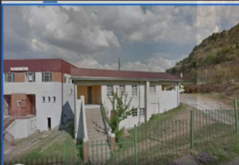
FC James Centre for AME Service - Lesotho

In Lesotho we have over 5300 students being taught by only 173 teachers. In most places there is little infrastructure to support the learning environment and committed teachers are in need of training.